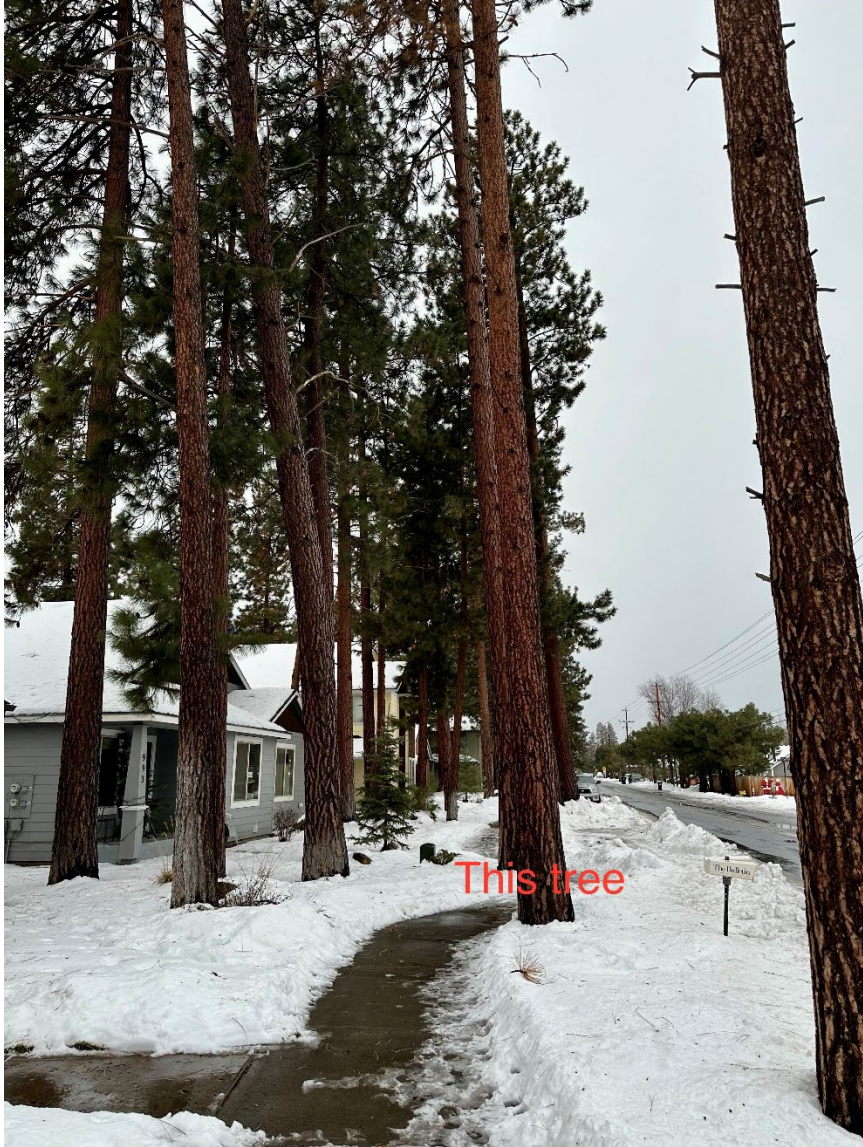
Dead Ponderosa Pine at 1001 E Cascade Ave