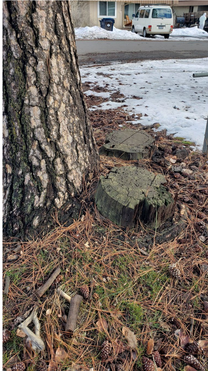
Leaning Ponderosa Pine near 275 N Cedar St