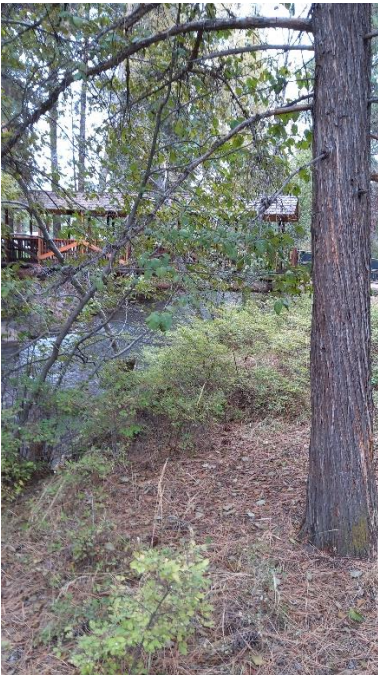
Dead Juniper, close to bridge and southside of Whychus Creek.

FISCAL IMPACT: Loss of urban ROW trees depletes the overall forested city-scape. Estimated cost of removal is about $1600 for all 4 trees. Trees already have yellow X's on them and marked for removal.