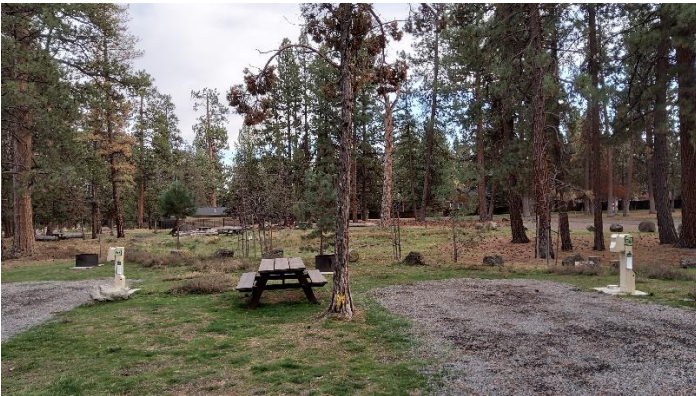
Dead Juniper, between sites 57 and 58

2 Dead Ponderosa Pines are currently present in Creekside Campground. Additionally, there are 2 dead Junipers as well.