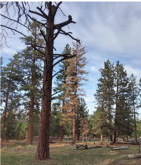
Dead Pine, north side of dog-play area, close to ODOT station.