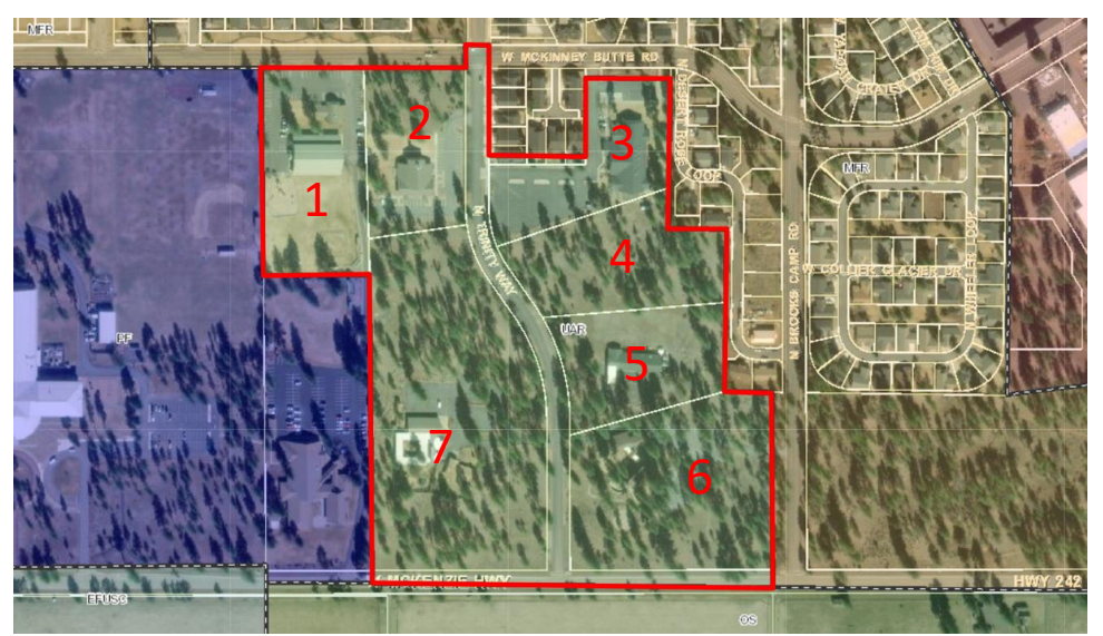
Figure 3. Aerial photo of subject properties.

SURROUNDING LAND USES: The properties to the north are zoned Multi-Family Residential District and developed with the Village at Cold Springs, Cold Springs South, and Village Meadows residential subdivisions. The properties to the west are zoned Public Facility District and developed with the Sisters Community Church and Sisters Middle School. The property to the east is zoned Multi-Family Residential District and developed with the Village Meadows and The Pines residential subdivisions. Also to the east is a vacant parcel is the location of the recently approved, but not yet constructed, Sunset Meadows subdivision. The property to the south is zoned Exclusive Farm Use, located outside of the City of Sisters Urban Growth Boundary, and developed with a farm use commonly referred to as the Patterson Ranch.