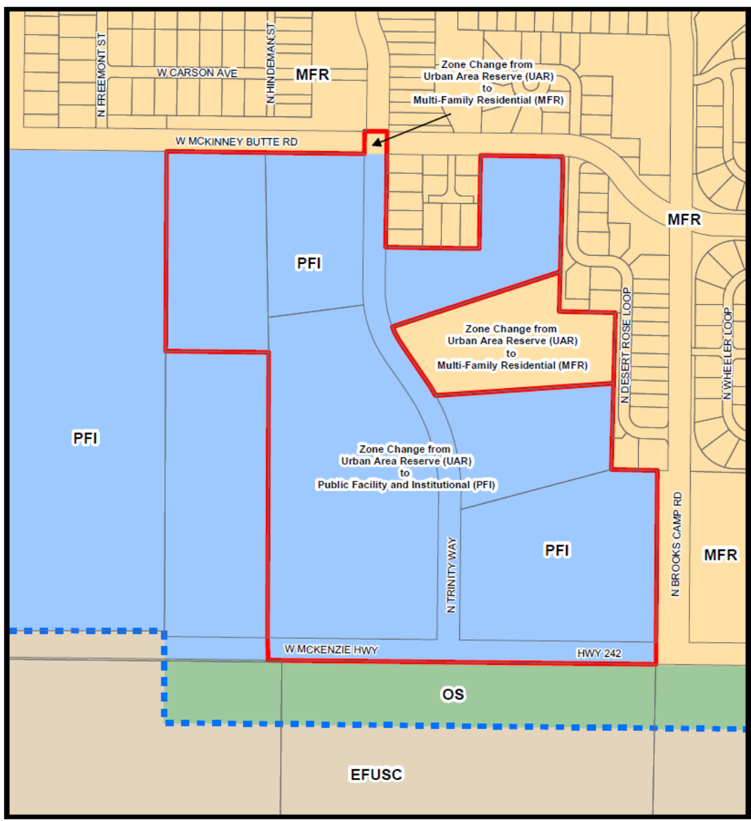
Figure 2. Zoning Map Amendment