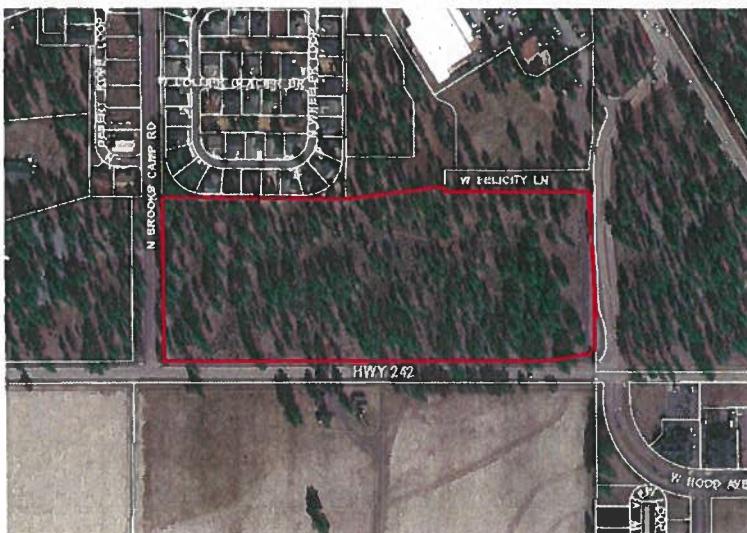
Aerial photo of subject property