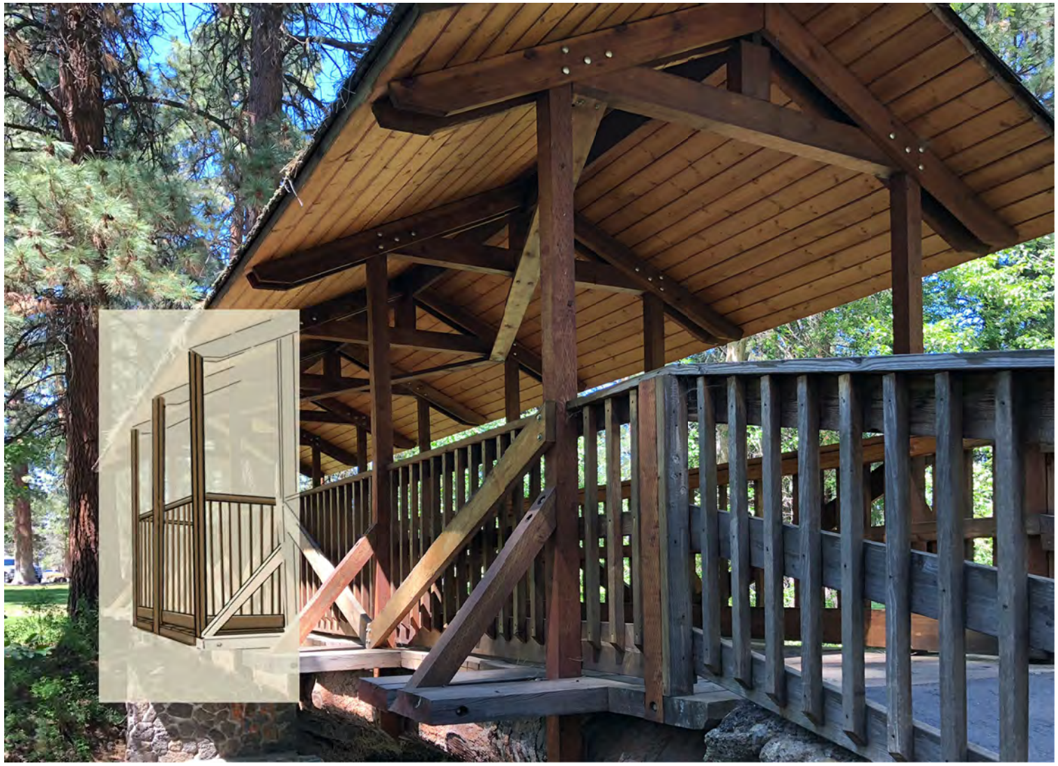
PROPOSED BRIDGE BUMPOUT