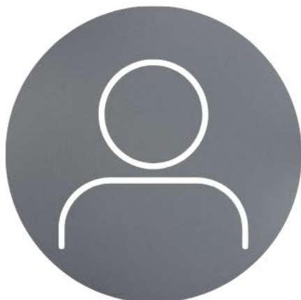
Vacant Director of Membership